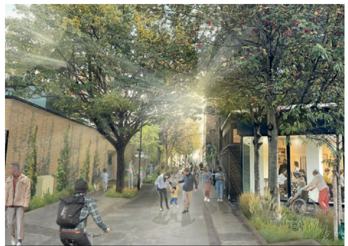
Artist's impression: proposed upgrades to North Gower Street

Close by, Camden Council is also working with the community to make North Gower Street greener, safer, and healthier. Plans include better lighting, art installations, living walls, and eight rain gardens to absorb rainfall and improve air quality. High-quality cycle routes will be maintained with improvements expected by spring 2025.