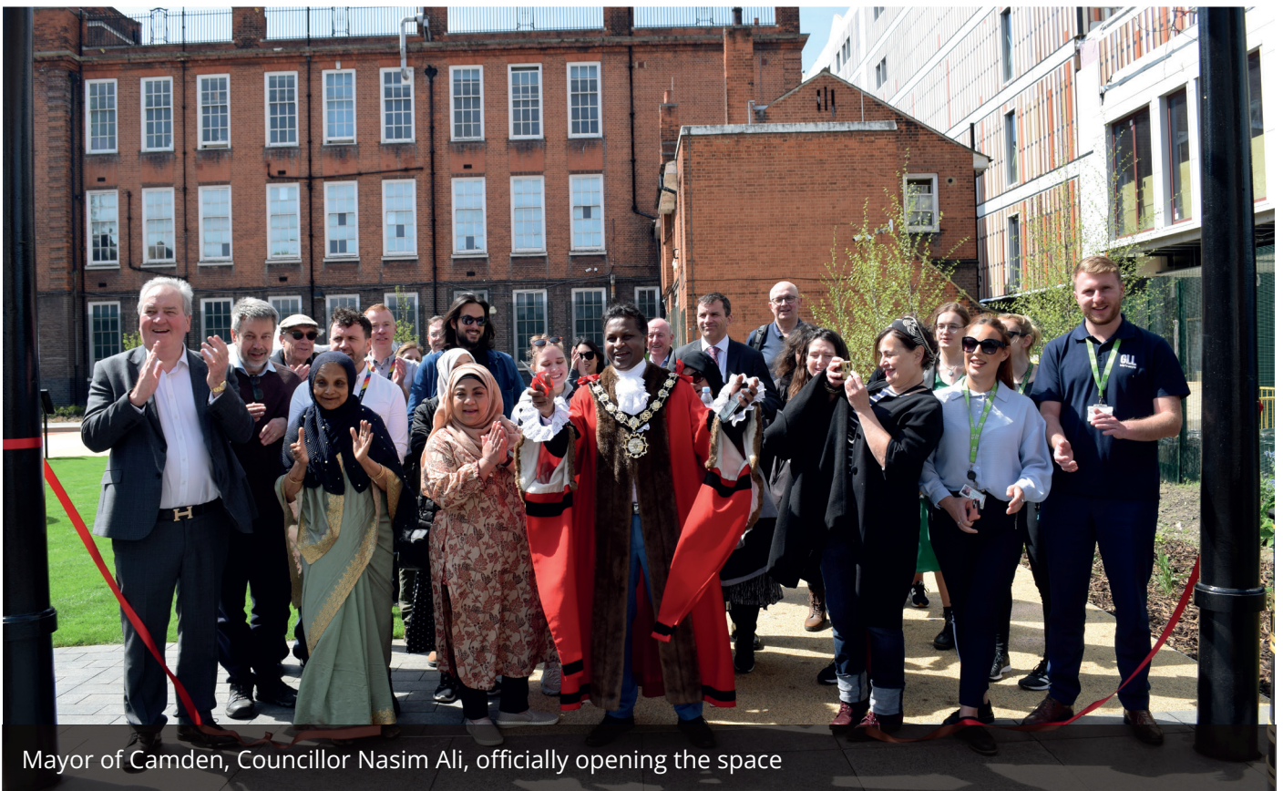
Mayor of Camden, Councillor Nasim Ali, officially opening the space

Other improvements include 14 new trees, a large lawn and new planting including a wildflower meadow area. The benches and bins have been refurbished from across the borough.