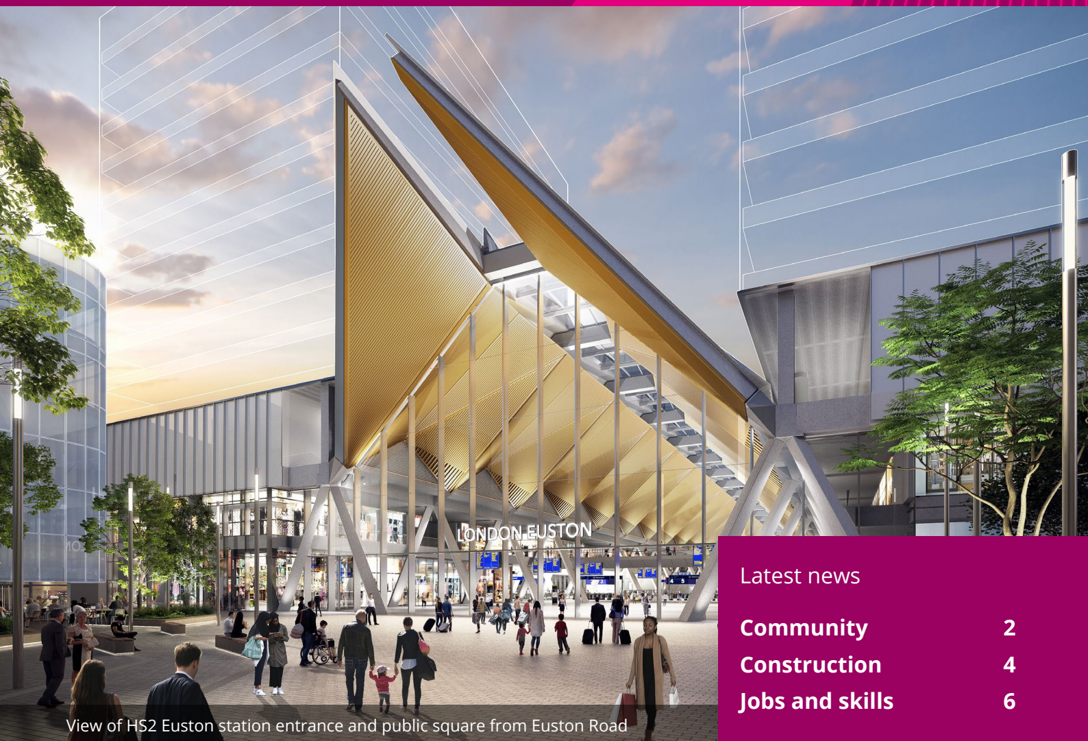
View of HS2 Euston station entrance and public square from Euston Road